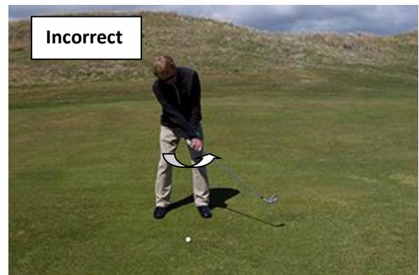
Pic 2: Too Much Hand / Clubface Rotation

In pictures 1 & 2, I'm demonstrating what I see some golfers doing through impact, i.e. either 'scooping' their wrists or rolling their hands too much.