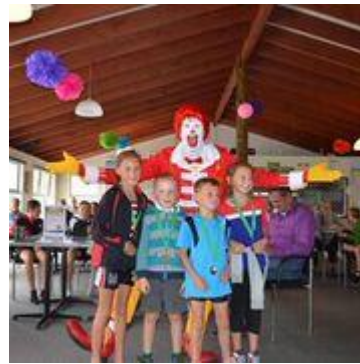
The WGC Winning Ambrose team