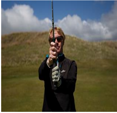
Pic 3: Hands Split