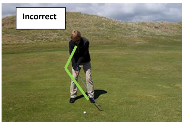
Pic 1: Poor Impact Scooping the Ball