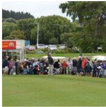
The welcome to players and families